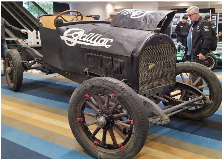
Winning Cadillac in 1921 on display at Ellerslie Car Show