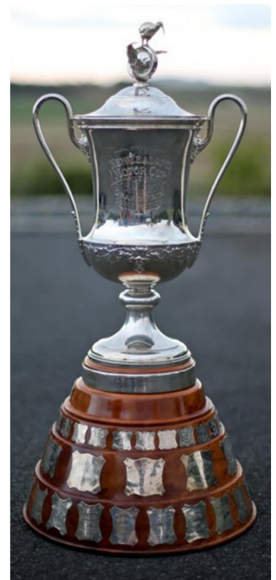
Value 100 guineas - 1921